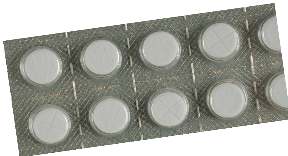
Blister pack of Rohypnol® tablets

Rohypnol® is a Schedule IV substance under the Controlled Substances Act. Rohypnol® is not approved for manufacture, sale, use, or importation to the United States. However, it is legally manufactured and marketed in other countries. Penalties for possession, trafficking, and distribution involving one gram or more are the same as those of a Schedule I drug.