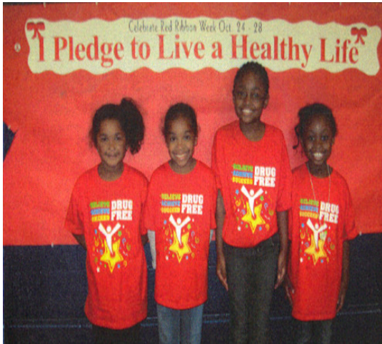
Pledging to live a healthy and drug free life!