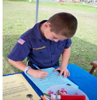
Scouts taking the DEA Drug Free Pledge

The DEA Red Ribbon Patch is an initiative designed to provide Boy Scouts and Girl Scouts the opportunity to earn a patch from the Drug Enforcement Administration (DEA) by performing anti-drug activities in commemoration of Red Ribbon Week. Furthermore, this initiative seeks to empower young people to create, embrace, and strengthen their drug free beliefs.