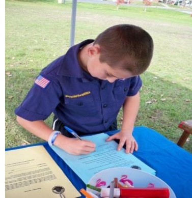
Scouts taking the DEA Drug Free Pledge

The DEA Red Ribbon Patch is an initiative designed to provide Boy Scouts and Girl Scouts the opportunity to earn a patch from the Drug Enforcement Administration (DEA) by performing anti-drug activities in commemoration of Red Ribbon Week. Furthermore, this initiative seeks to empower young people to create, embrace, and strengthen their drug free beliefs.