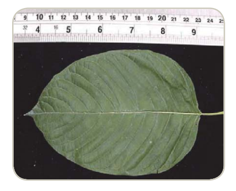
Leaf of kratom tree