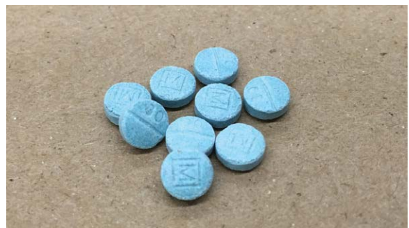
Clandestinely produced counterfeit oxycodone tablets that contain fentanyl.

Abuse of clandestinely produced synthetic opioids parallels that of heroin and prescription opioid analgesics. Many of these illicitly produced synthetic opioids are more potent than morphine and heroin and thus have the potential to result in a fatal overdose.